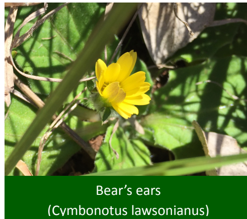
Bear's ears (Cymbonotus lawsonianus)

If this land is not managed for these purposes it will continue to degrade leading to a major loss of habitat, wider establishment of invasive weeds, encourage further illegal dumping, resulting in reduced conservation value and the potential for adverse development.