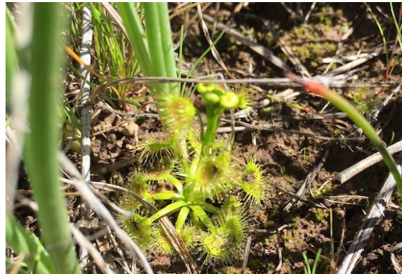
Pale sundew ( Drosera peltata )

WHO: Friends of Murrumbateman Village Grassy Woodland is a group of Murrumbateman residents passionate about maintaining an open space by protecting and enhancing its existing conservation value.