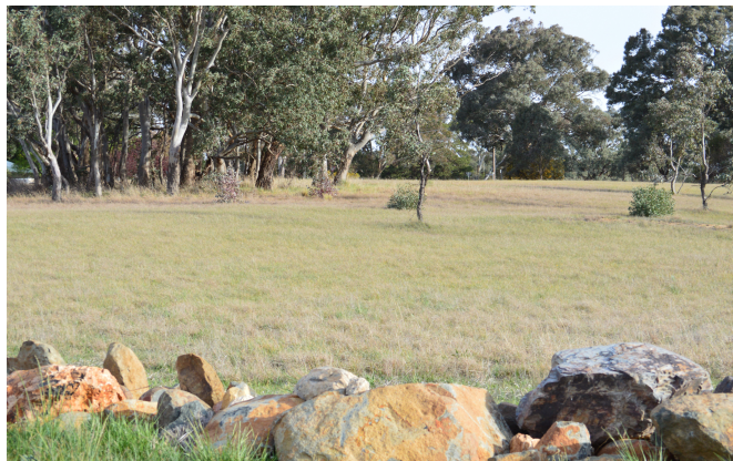
Looking across the grassy woodland

CONTACT: Please email to join and show your support mvgrassywood@gmail.com