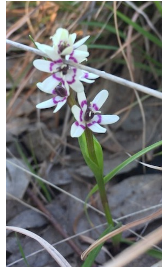
Early nancy ( Wurmbea dioica )

A community project under Murrumbateman Landcare Group