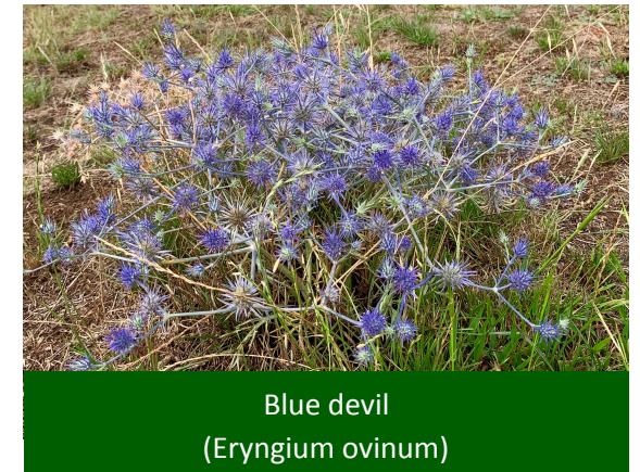
Blue devil (Eryngium ovinum)

We also hope to install educational display boards, construct a safer walking track, install fencing for protection and vehicle exclusion, and seating. Crown Lands permission and grant funding is required for these activities.