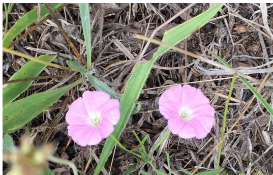
Australian bindweed ( Convolvulus angustissimus )

SUPPORT: Join the Friends group to support this community project to protect and enhance this land. Later, your assistance will be sought for tasks such as planting, clean up, weed pulling, installing seats or protective fencing.